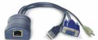
Example CAM: CATX-USB-A

Input: 100-240VAC 0.5A 50-60Hz Output: 5VDC 2.5A