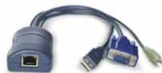
Example CAM: CATX-USB-A

CAM: Computer Access Module PS/2 only: CATX-PS2 PS/2 plus audio: CATX-PS2-A USB only: CATX-USB USB plus audio: CATX-USB-A Sun plus audio: CATX-SUNA Single Rack Kit: RMK-ALIP Dual Rack Kit: RMK-ALIP-Dual Serial upgrade cable: CAB-9M/9F-2M Slave power switch for connection to AdderView CATxIP 1000 or master power switch: PSU-8SLAVE Master power switch for connection to AdderView CATxIP 1000 or standalone Ethernet operation: PSU-8MASTER